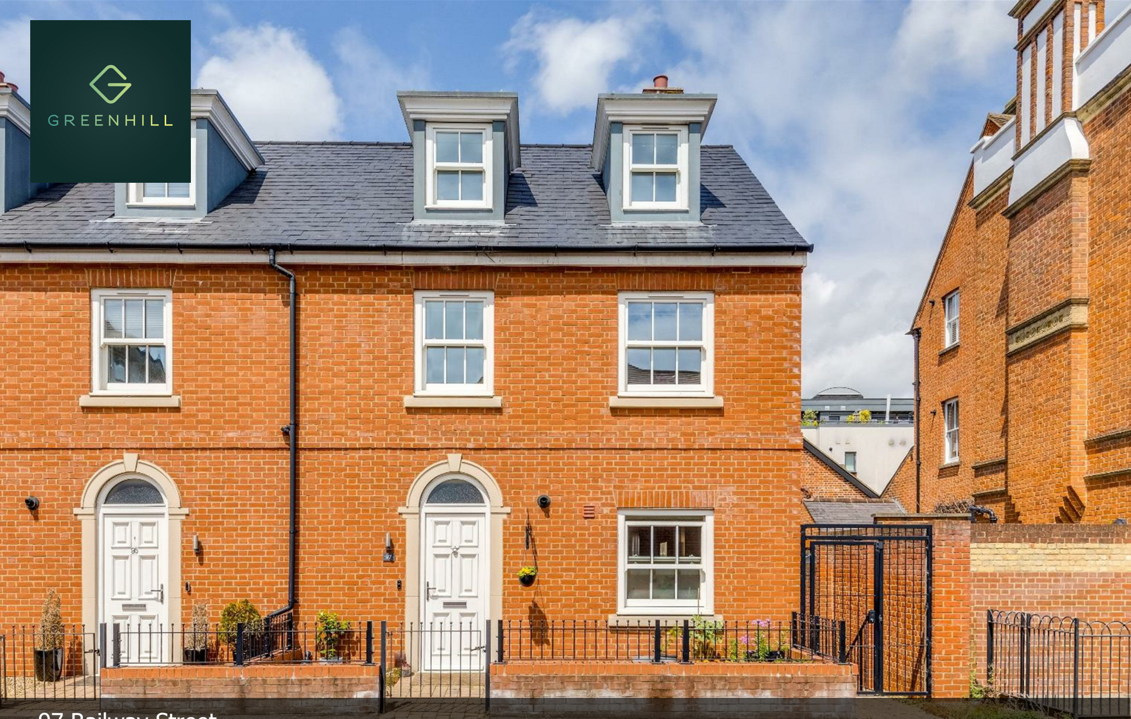
97 Railway Street , Hertford, SG14 1RP Guide price £850,000